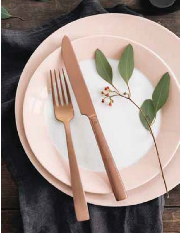
PORCELAIN ARZBERG - TRIC SOFT ROSE CUTLERY SAMBONET - FLAT VINTAGE PVD COPPER