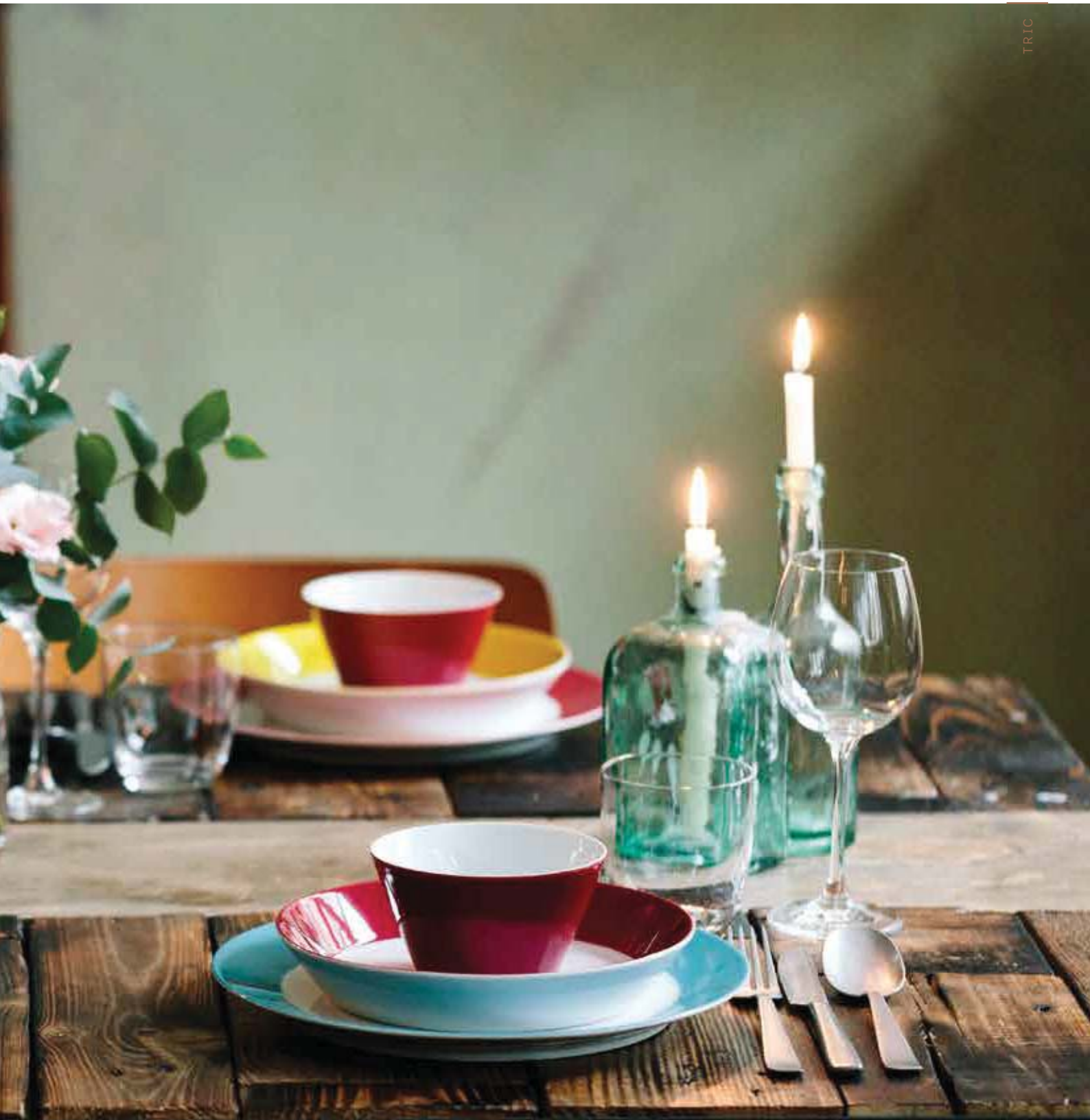
PORCELAIN ARZBERG - TRIC AMARENA, YELLOW AND BLUE CUTLERY SAMBONET - FLAT VINTAGE